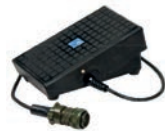
CONTROL REMOTO DE PIE HR99810012 - 5 m