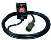
CONTROL REMOTO HR99810016 - 10 M HR99810013 - 4 M